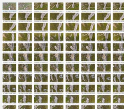
MapsMadeEasy 3D Models