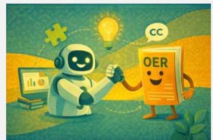
OER and AI Tutorial