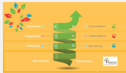
Being and becoming an early years teacher