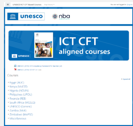
UNESCO ICT CFT inspired teacher training courses